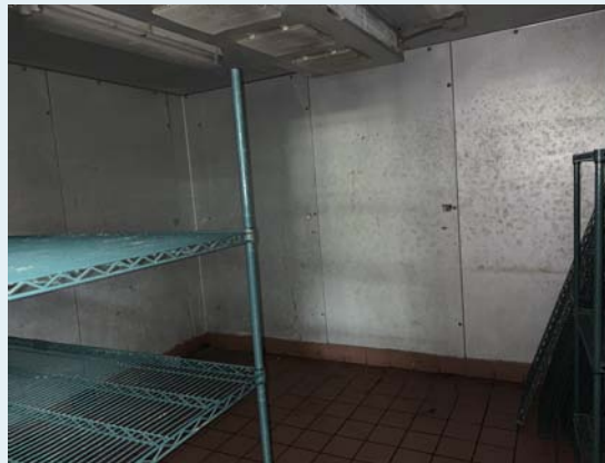
LARGE KITCHEN & REFRIGERATION